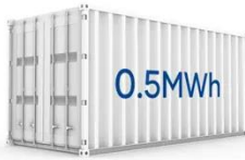
Standard 20ft containers