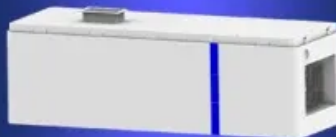
AI-W5.1-Base (Battery Base)